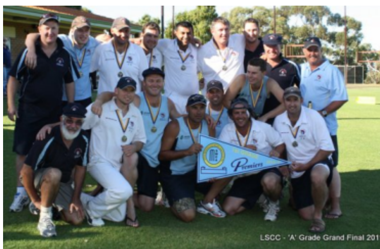
LSCC - 'A' Grade Grand Final 2011